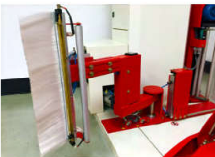
Automatic Film Cut & Wipe Arm