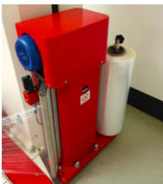
Film Carriage Assembly